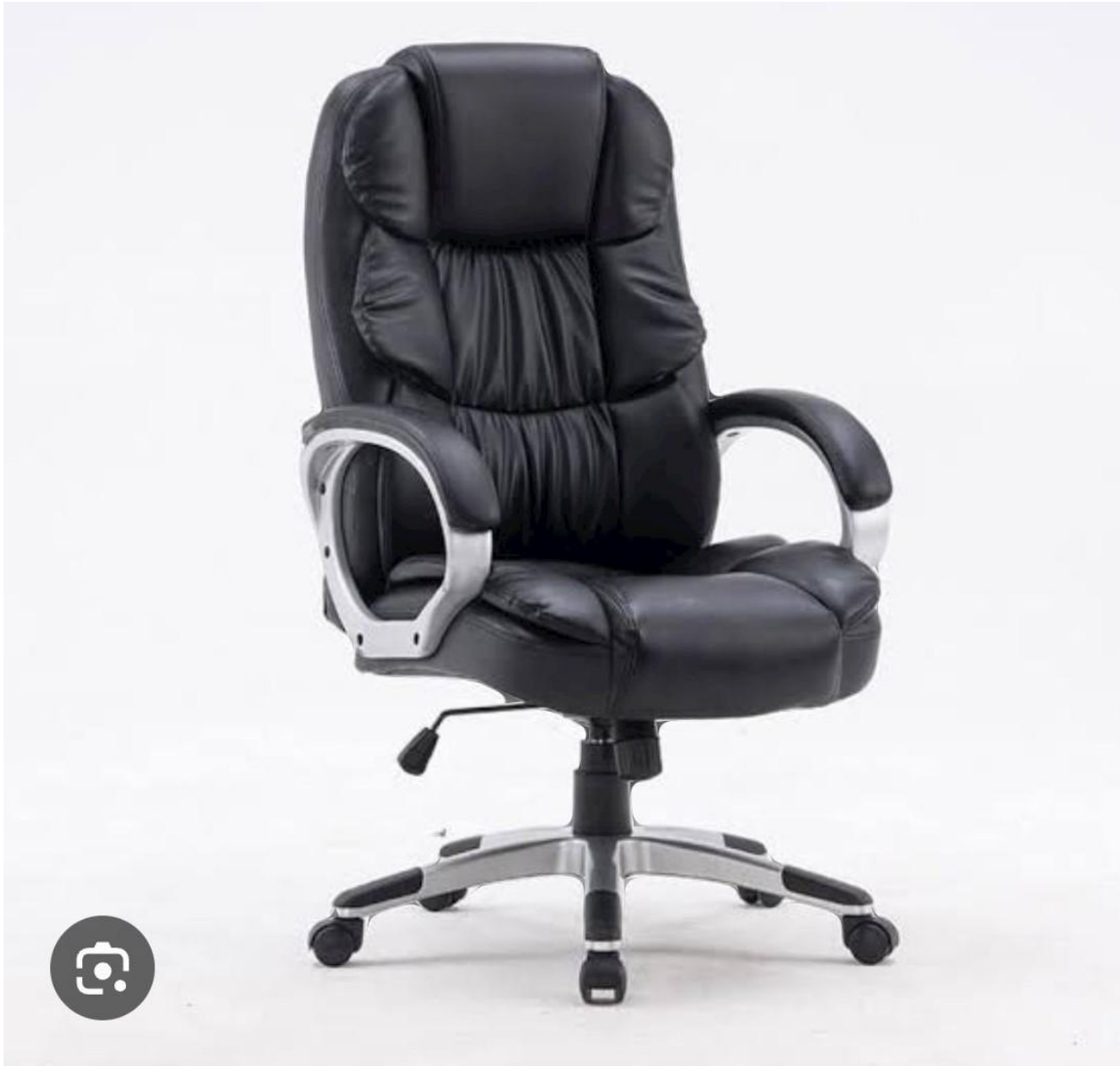
Lily High Back Office Chair