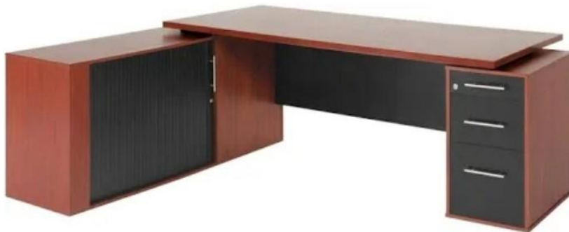
Prestige L-Combo Desk Lhs